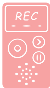
voice recorder (optional)